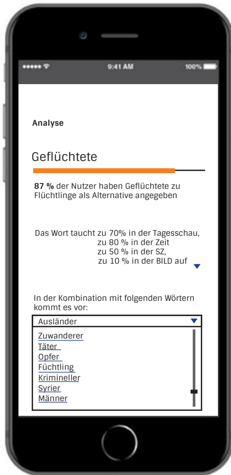
Natural Language Processing